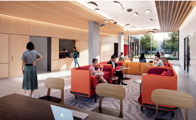
A new student residence will offer enhanced living and learning spaces (above and at right).

clinical care, and empowering students with the necessary resources to become tomorrow's health-care leaders.