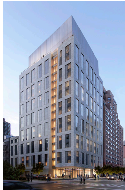
The residence is expected to be completed in 2025.