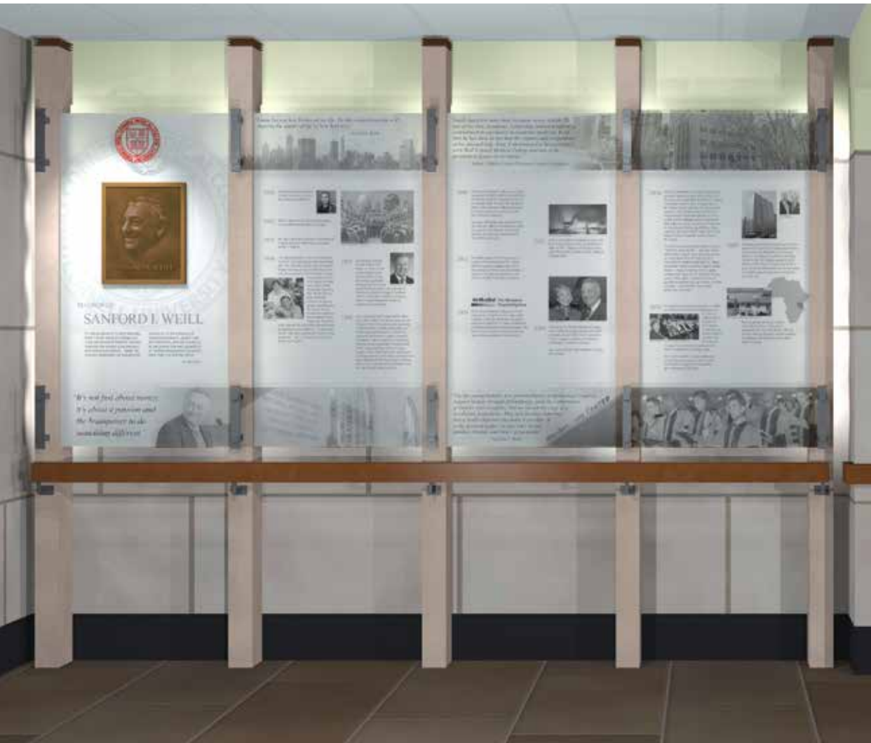
This timeline, created in honor of Sandy Weill's 80th birthday, is displayed in the main corridor of 1300 York Avenue.