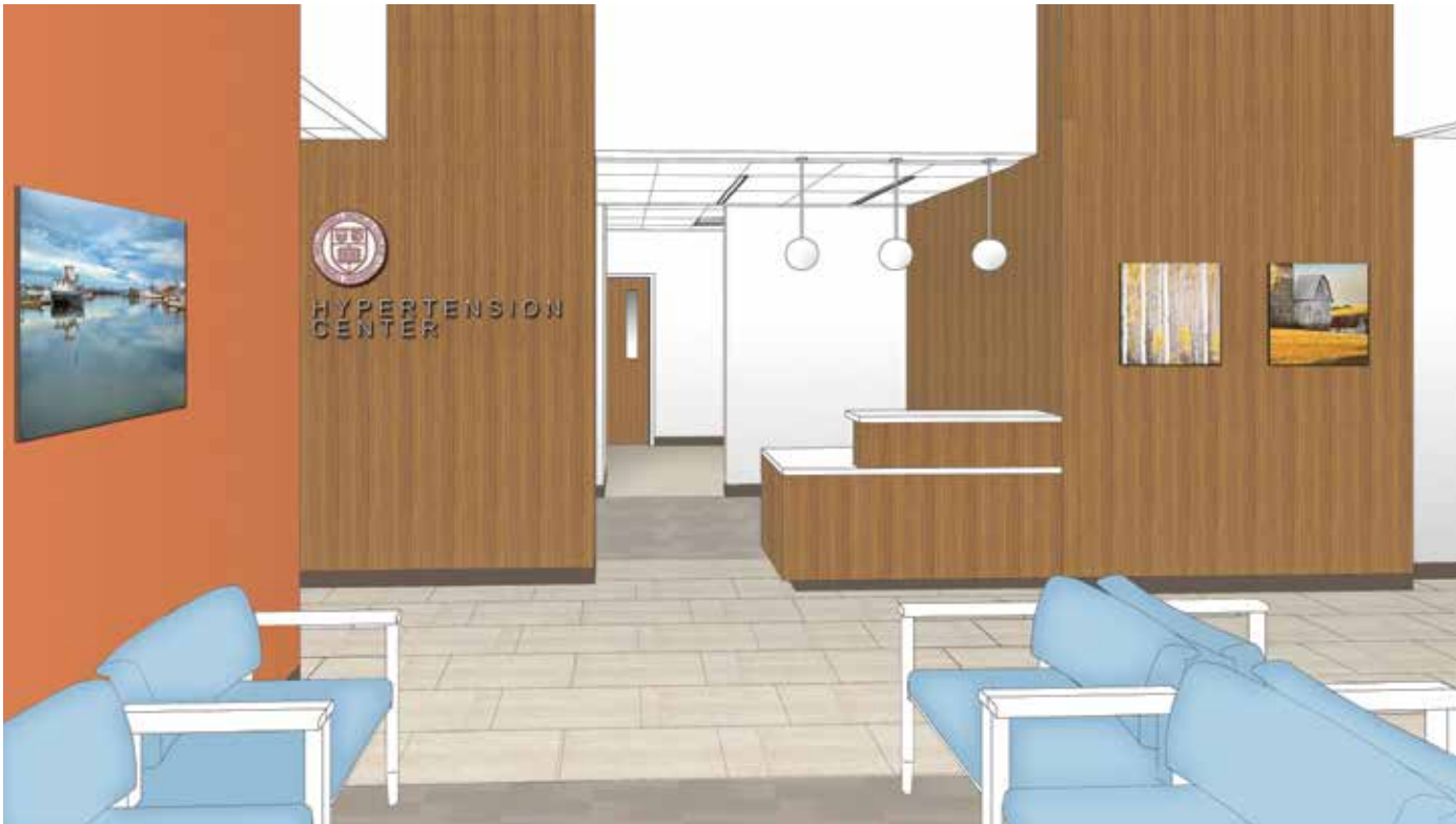
A rendering of the Weill Cornell Medical College Hypertension Center