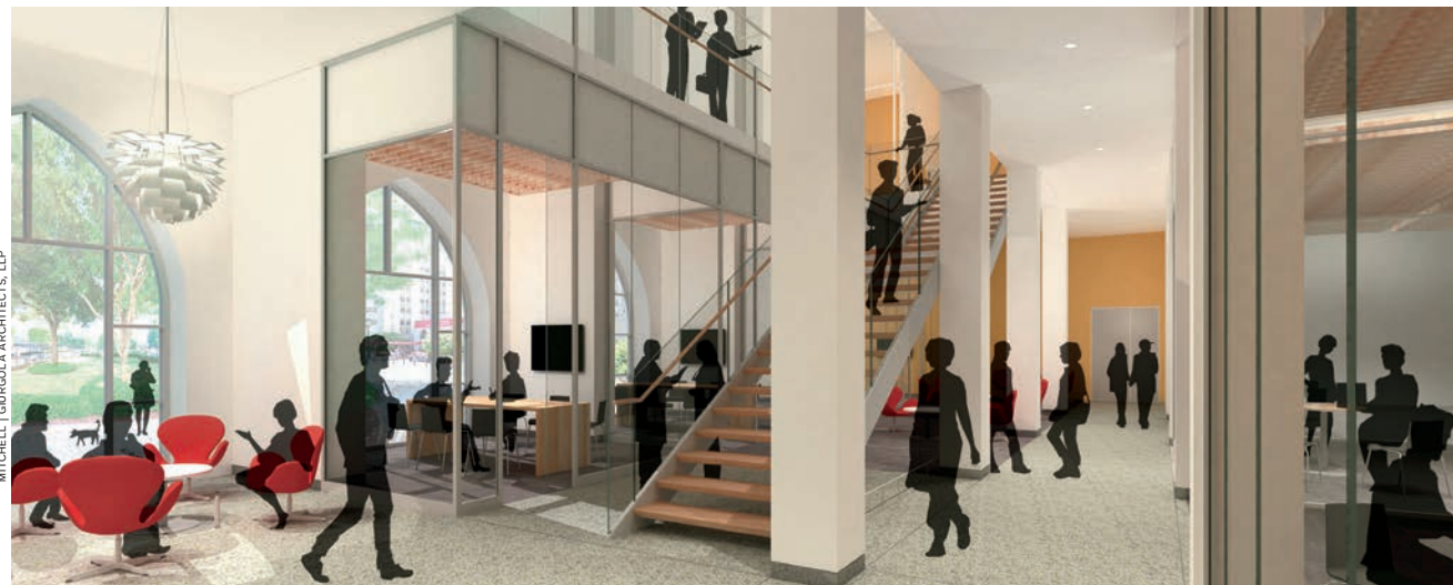
Rendering of the Feil Family Student Center, first floor