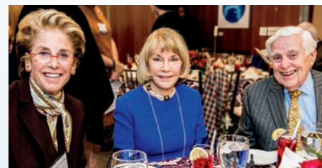
Guests enjoy the presentation at the Information Please event